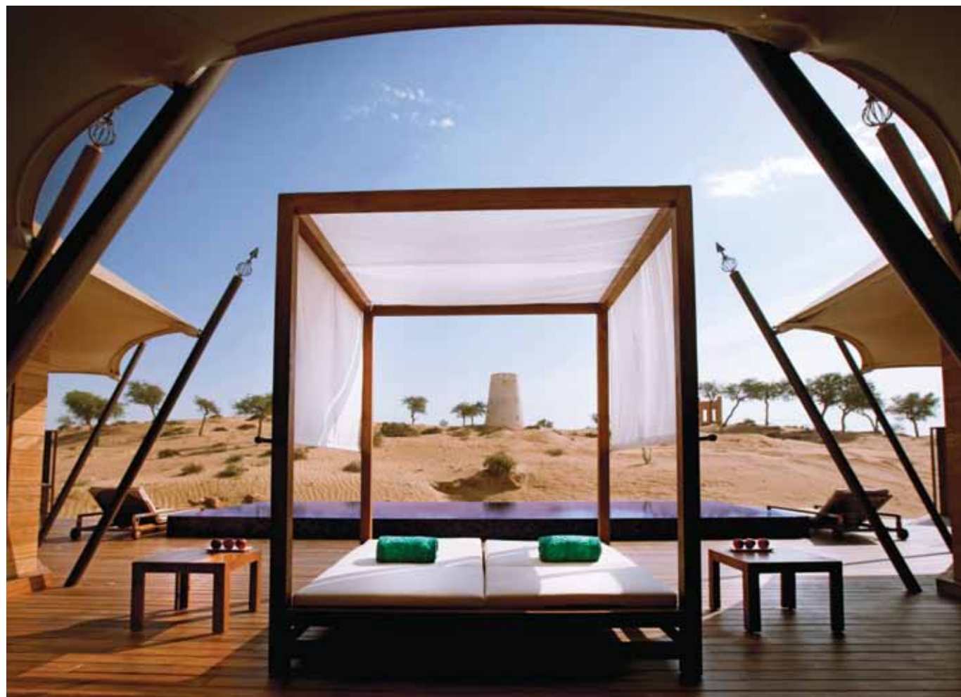
Al Khaimah Tented Pool Villa

Relax in style at the Al Khaimah Tented Pool Villa. Revel under the canopied ceiling of this Bedouin-style desert dwelling and admire the mesmerising Arabesque décor.