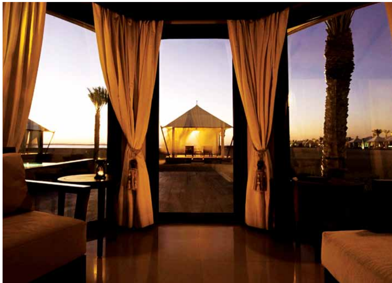
Beachfront Pool Villa