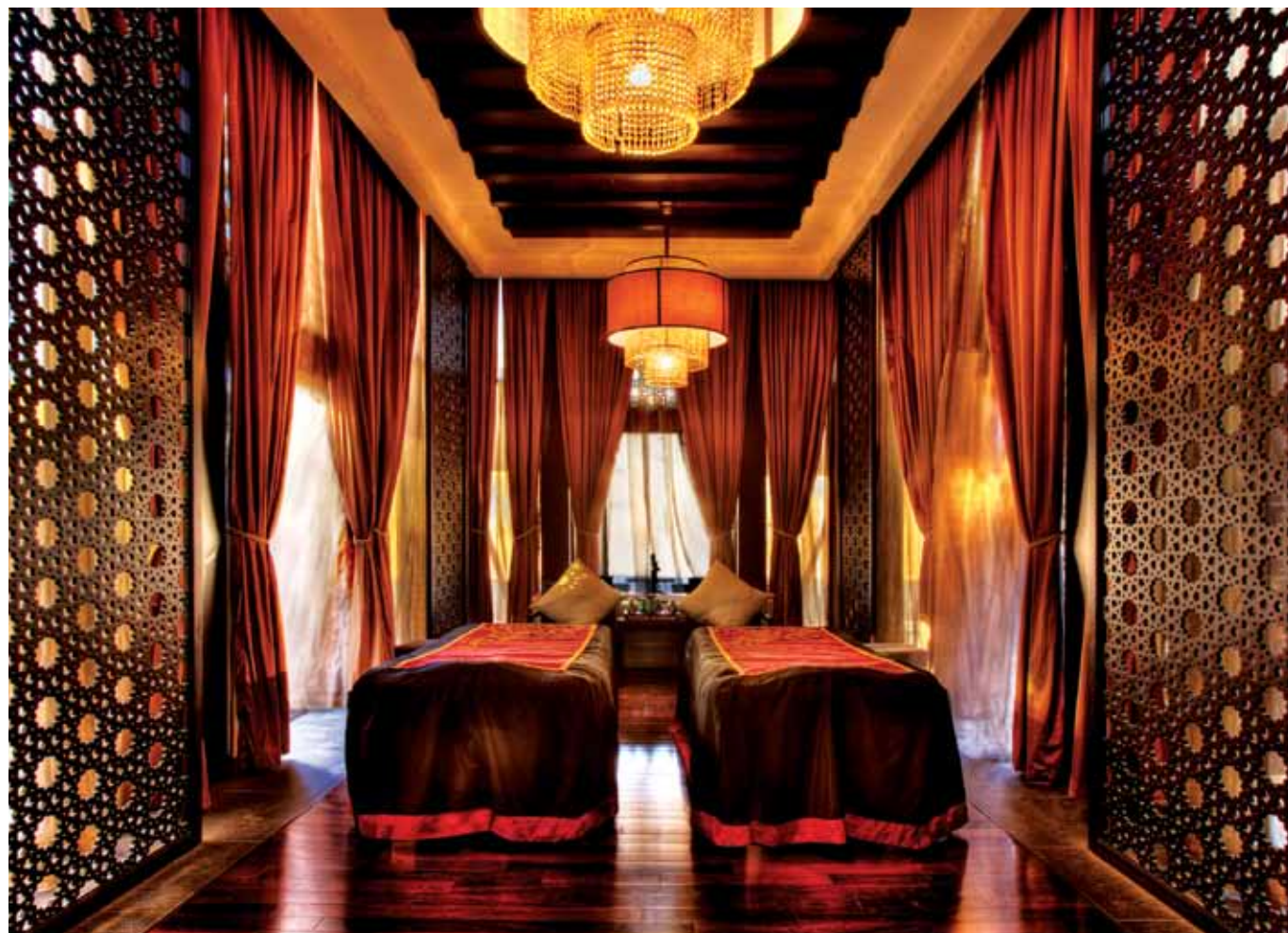
Banyan Tree Spa