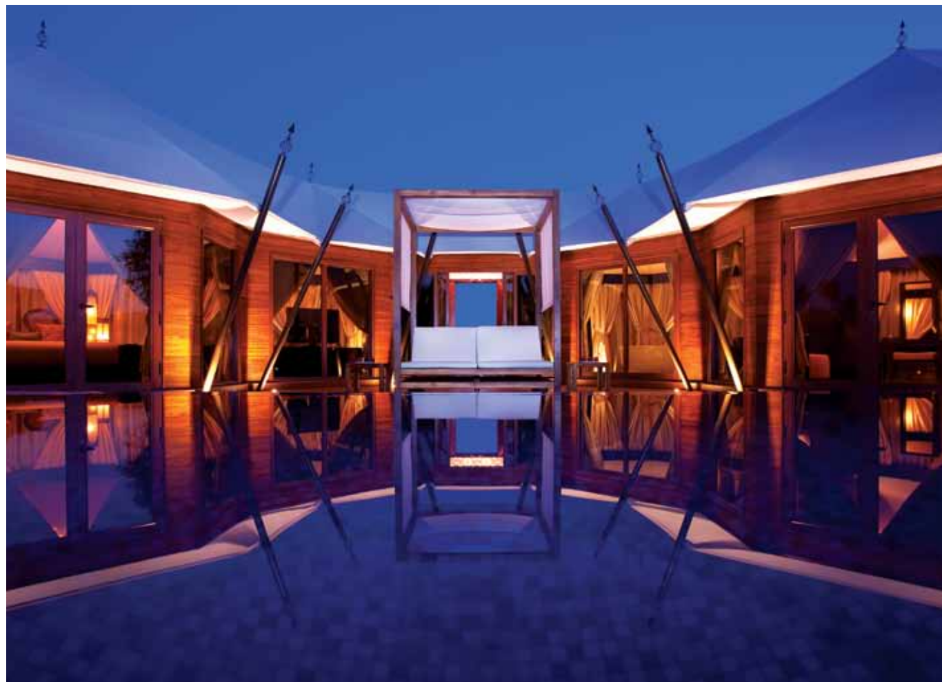
Al Sahari Tented Pool Villa

Experience hospitality at its finest with a stay at an Al Sahari Tented Pool Villa. Set apart by sand dunes, this exclusive palatial abode is the height of luxury.