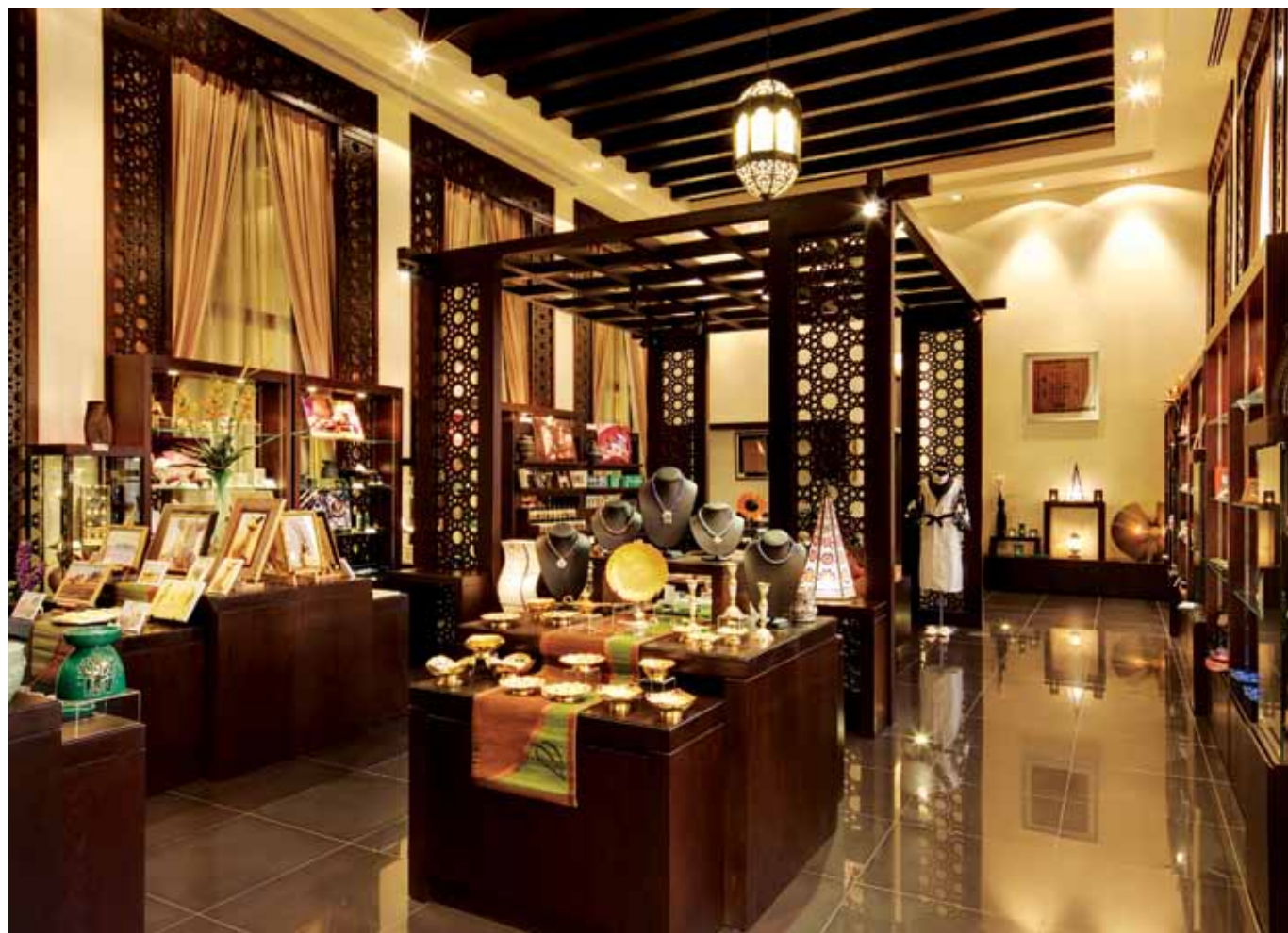
Banyan Tree Gallery