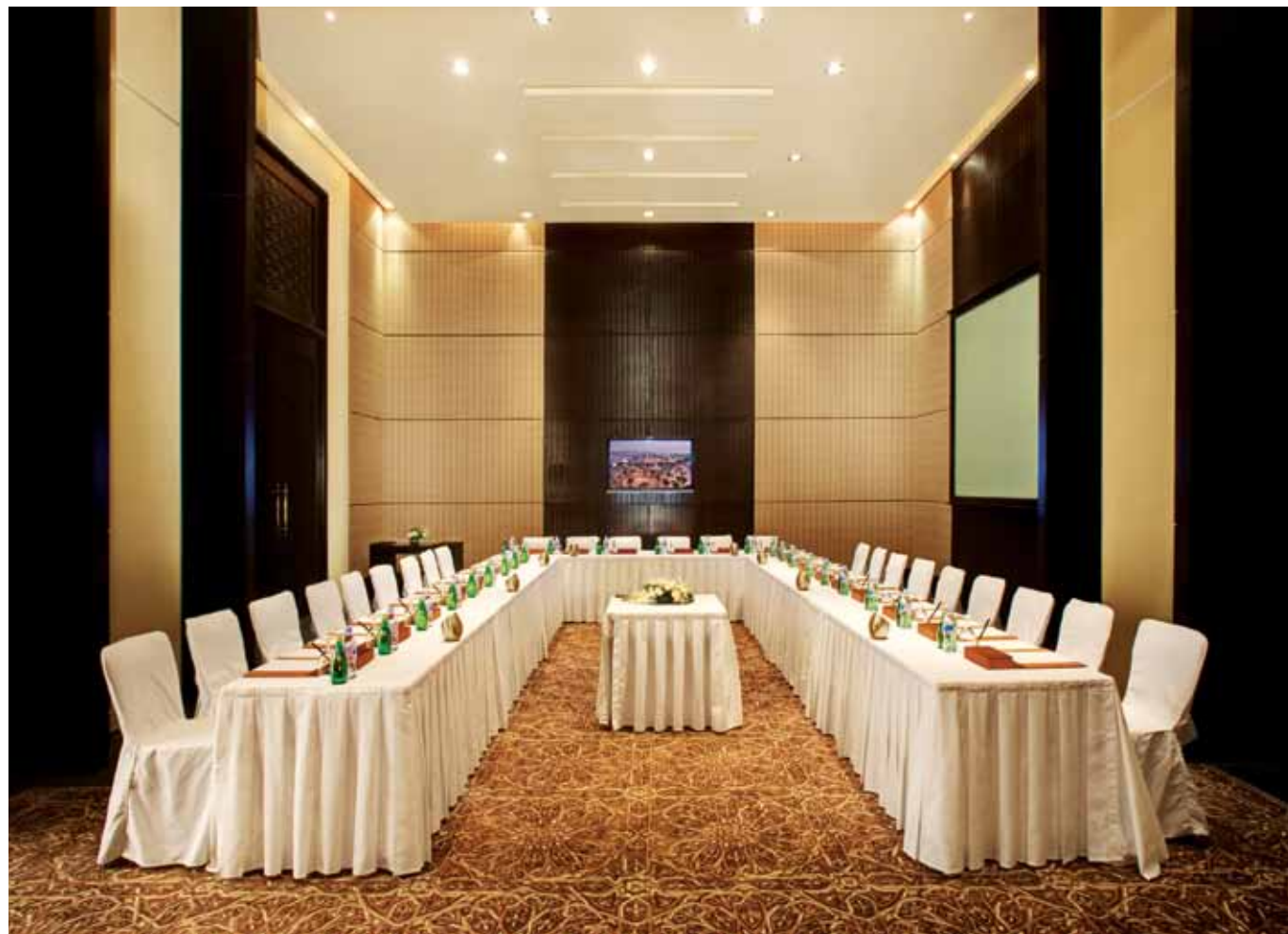
Najah Meeting Room

Business functions can be held in the Najah meeting rooms while grand gala events take place at the Banyan Hall. Sophisticated facilities and professional managers will take care of all your event needs.