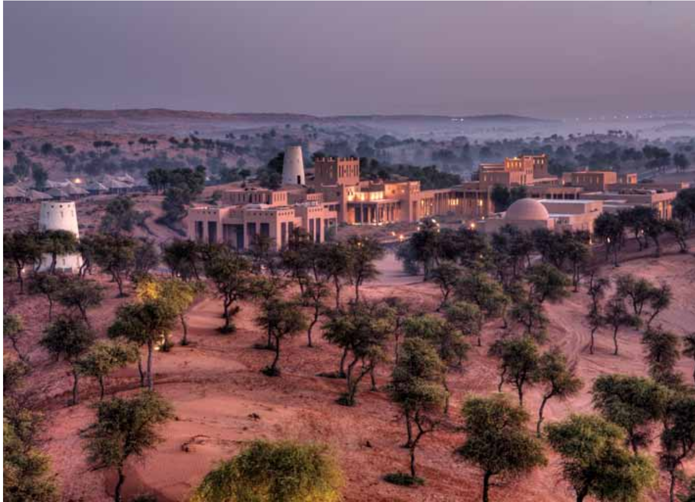
Banyan Tree Al Wadi