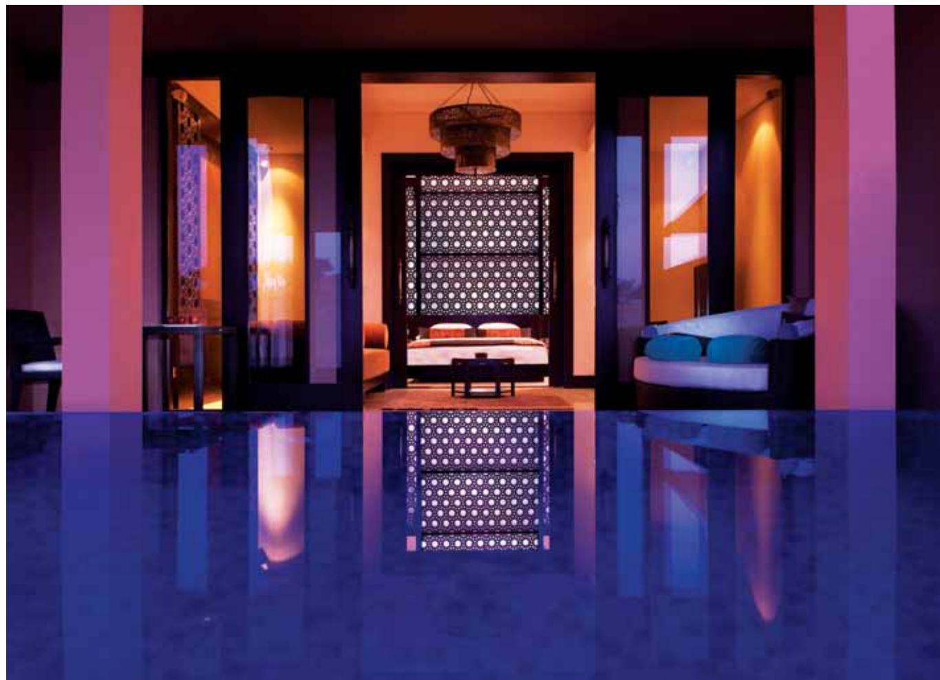
Al Rimal Deluxe Pool Villa